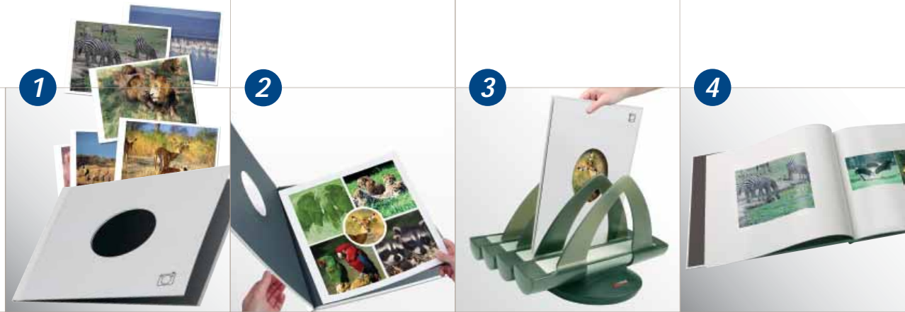
Photo albums Marriage hand-outs Model Portfolio Product presentation